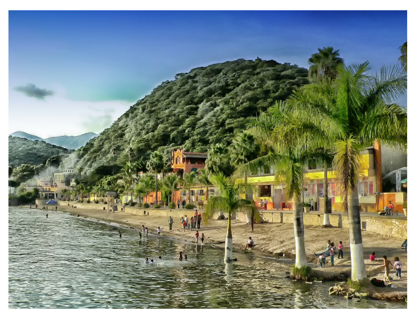
Swimming in Lake Chapala

Testing of the water at Lake Chapala, for recreational safety, found a coliform count of 50. To help put this in perspective, at a US public beach, the water is declared safe to swim in if the coliform count is under 126.